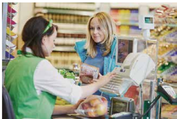
RETAIL CHECK STANDS, BANKS, POST OFFICE, AIRPORT COUNTERS, AND HOSPITALS