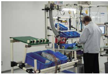
LEAN MANUFACTURING WORKSTATIONS